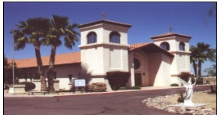
Our Lady of the Sun Shrine. A testimony of a priest's faith.