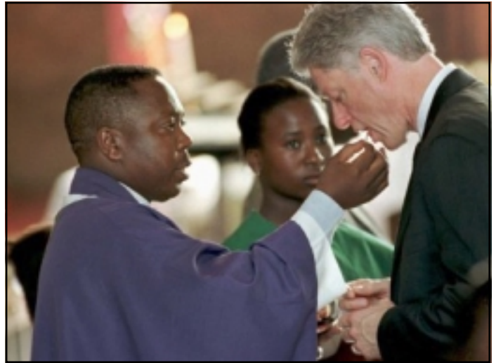
The President's actions sent shock waves to the Catholic world.

Now, he no doubt believed that by availing himself of one of